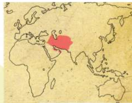
▲ A map of the Sasanian Empire in 531 CE when it was at its greatest extent.

It is very unlikely that any merchants took part in direct long-distance trade. Instead, the exact size and composition of a given caravan must have changed with every stop and supply of fresh pack animals. In addition, one-humped camels (dromedaries or cross-breeds) and mules were used for the western parts of the Silk Route, whereas, in the east, only the shaggy haired, two-humped, Bactrian camels were capable of crossing the cold and hot extremes of the Pamir mountains and the Taklamakan desert.