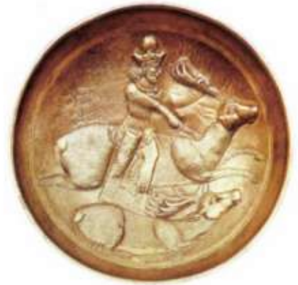
▲ This Sasanian gold plate with silver relief shows the 4th Century King Shapur II hunting.

No longer protected by the Han, the techniques of sericulture and silk weaving had slowly spread westwards, although China continued to produce the best quality silken twine and material. Using Chinese thread, Sasanian and Sogdian silk weaving industries flourished from Central Asia to Mesopotamia. Few examples of these silks still survive but some made their way to Europe, where they have been found wrapped around sacred relics, while other fragments have been discovered at Buddhist cave sites in the Tarim Basin. Their motifs and style heavily influenced the later designs of Chinese, Byzantine and Muslim cloth.