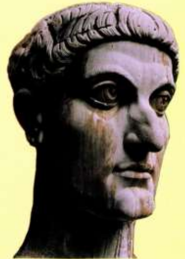
▲ The marble head of the Roman Emperor Constantine who ruled from 306 to 363 CE. This was part of a colossal sculpture that stood over 15 metres high.

During all this upheaval, overland trade inevitably declined but it did not cease altogether. The Byzantines still bought silk in large quantities and the Chinese, despite their internal problems, still contrived to send the material eastwards to meet this demand, by land and increasingly by sea. The Sasanians, like the Parthians before them, swiftly took on the profitable role of middlemen.