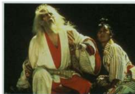
▲ Scene from the film Ran by the Japanese film director Akira Kurosawa (1910- ). The film was inspired by King Lear, one of William Shakespeare's (1564-1616) tragedies.

◀ There are many oriental restaurants in the West today. Even more authentically, these people are eating in China.