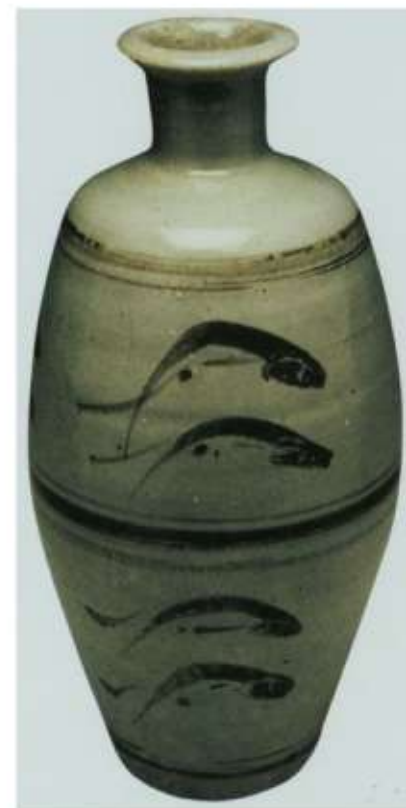
▲ Vase made by English potter Bernard Leach (1887-1979). Its design derives from older eastern ceramics.

On the other hand, western influences in the East, particularly in Japan, are everywhere to be seen. Giant companies pay fortunes for European paintings, and people everywhere wear western clothes, jewellery and hairstyles and listen to western music. Western dances and films are extremely popular, and western literature, from the tragedies of Shakespeare to the comic strip, influence contemporary writers, playwrights and film makers in Japan and other countries.