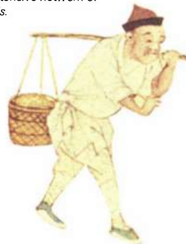
▲ Illustration from a Chinese scroll dating to the early Qing dynasty (1644-1912). It shows the building of a dyke. The Chinese undertook many huge engineering works, including the Great Wall and an extensive network of canals.

Via the Byzantine Empire (the name given to the Eastern Roman Empire from 610), the Arabs inherited many of the Roman methods of construction in their Islamic empire, combining them with knowledge gained from their Iranian territories. In later centuries as their military architecture developed, especially during the Crusades from the Eleventh to Thirteenth Centuries, there was much cross-fertilization between Islam, Byzantium and the West. Ideas passed from one region to another as improvements in siege techniques called for matching improvement in defences. Paradoxically, technological exchanges took place in the very areas where Islam and Christianity confronted each other. For example, the Islamic development of a 'machicolation' gallery projecting over the gateway, with holes in its floor through which boiling oil could be poured onto the heads of attackers, was used much later in castles as far west as Ireland.