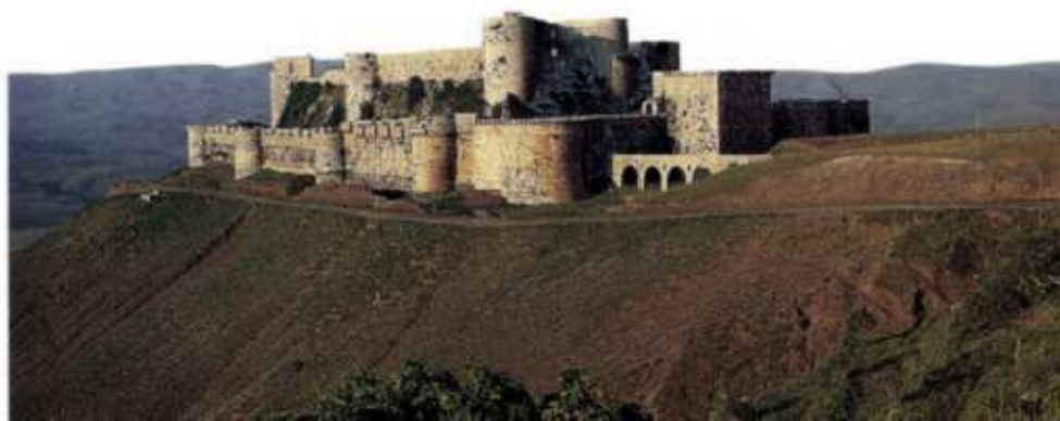
◀ View of the crusader castle of Krak des Chevaliers in Syria, built during the 12th and 13th Centuries. The Crusaders adopted many of the Arabic ideas for fortified buildings.