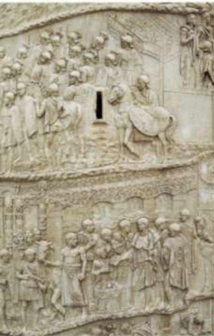
▲ Detail from the Emperor Trajan's Column in Rome. It shows a bridge built over the Danube by the Roman armies during the period when Trajan (53-117 CE) extended the Roman Empire into the regions north of that river.