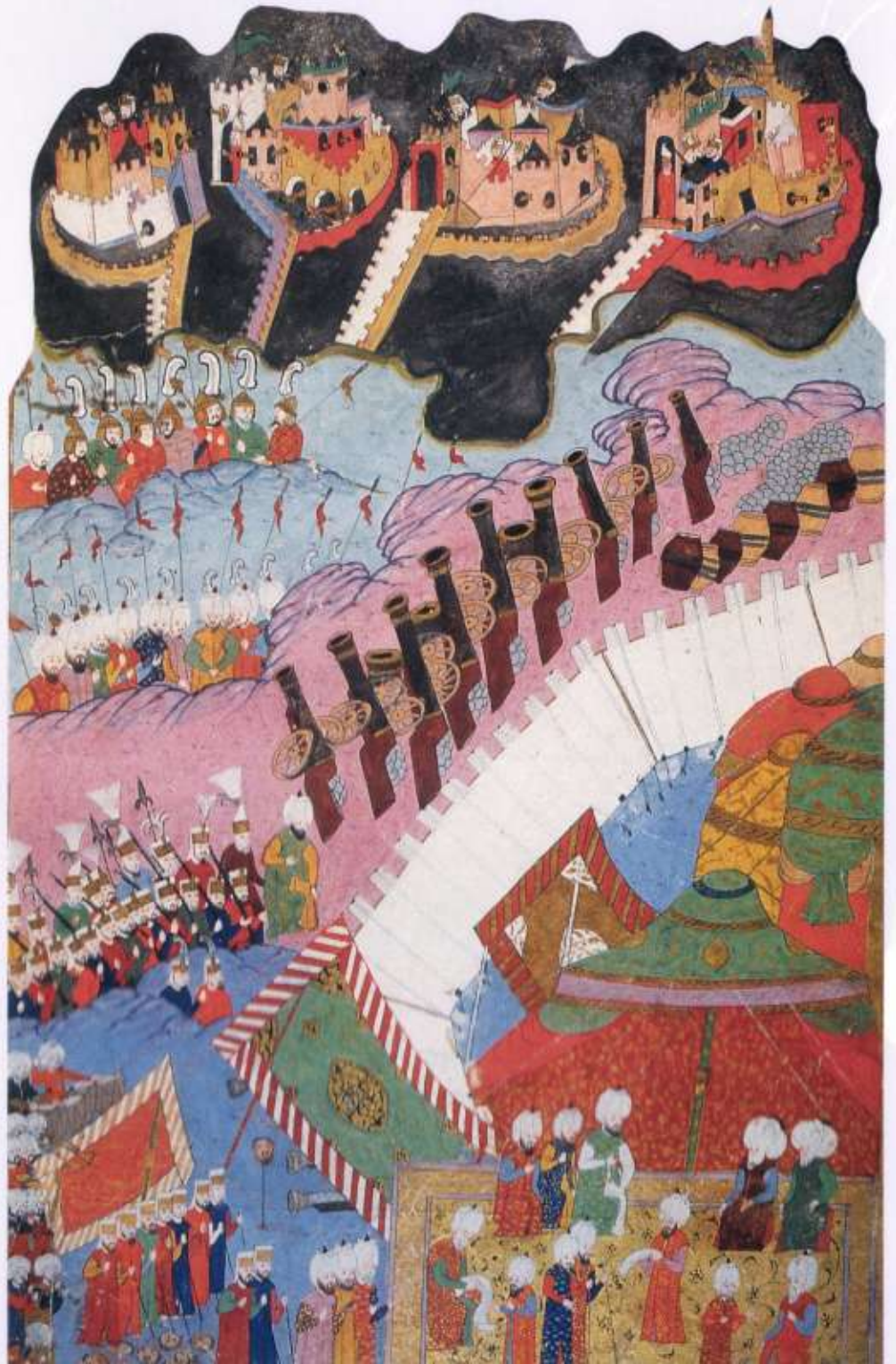
► Illustration from a 16th Century manuscript showing cannon being used by the Ottoman army during their siege of a Hungarian fort.