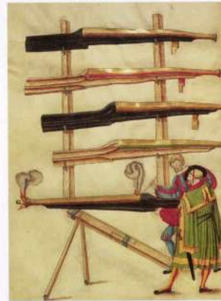
▲ Illustration of a collection of arquebuses, one at the bottom being demonstrated. It comes from a 16th Century work called The Book of Arms .