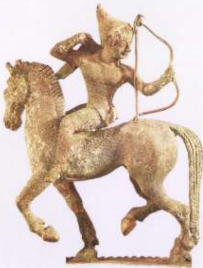
▲ Bronze sculpture of a Parthian bowman using a composite bow. He has just fired one arrow and is pulling out another from his quiver.

Military architecture needed to become ever more sophisticated to withstand the use of more powerful weapons. People have always been remarkably inventive when it comes to developing new weapons. There has always been a need for an advantage over enemy forces, to kill more people at greater distances.