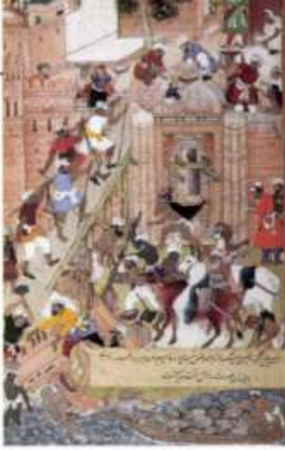
▲ 16th Century Mughal manuscript illustration showing the Red Fort in Agra, India being built.