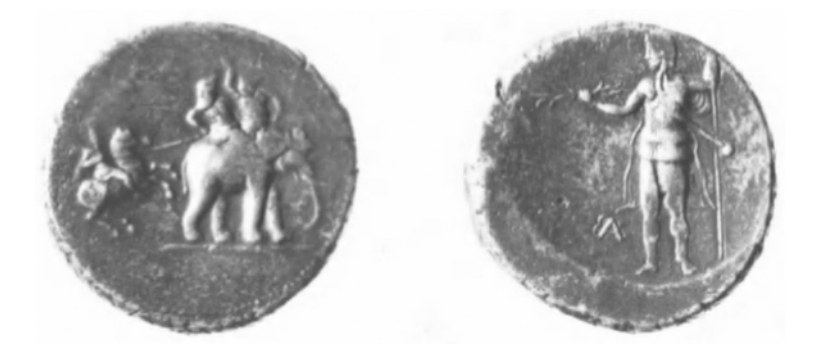
FIG. 1. Silver coin with the figure of Porus (BMC 191, 61).